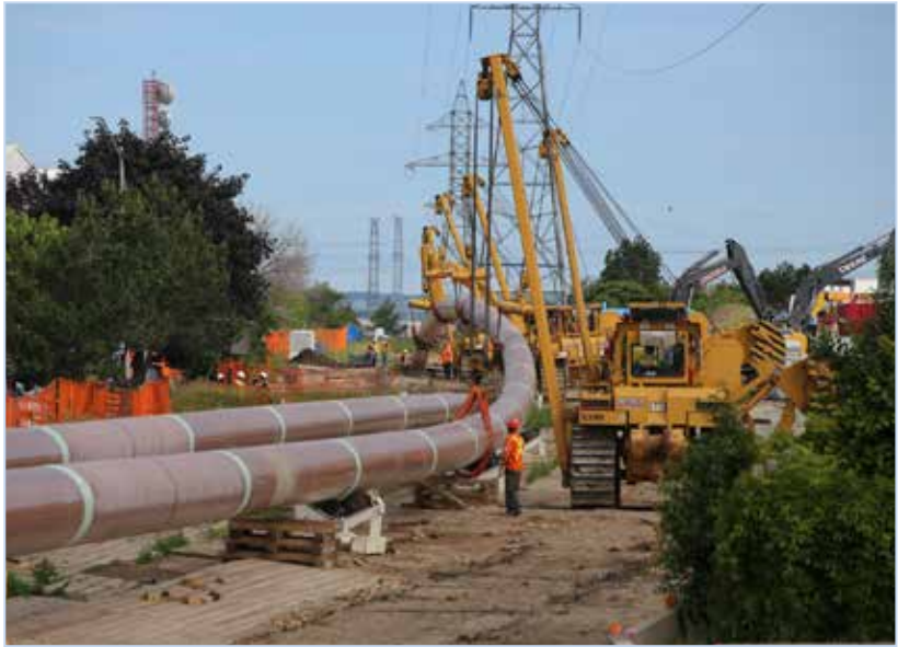
Michels Canada Co. constructing Enbridge Gas Distribution Inc.'s largest project in history

As with all Michels Canada Co. projects; safety, quality, and environmental stewardship are of the utmost importance in the pipeline construction industry.