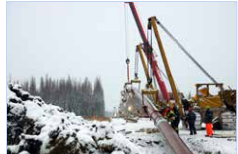
Waschuk Pipe Line Construction Ltd. today